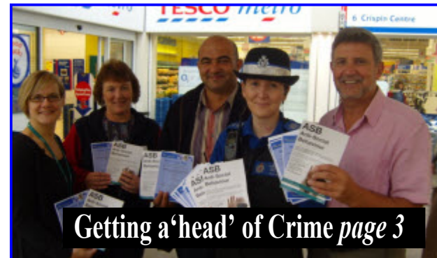
Getting a 'head' of Crime page 3