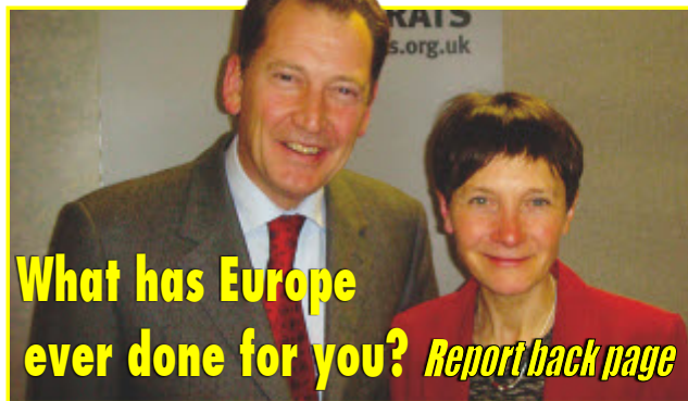
What has Europe ever done for you? Report back page