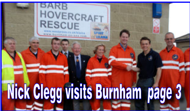
Nick Clegg visits Burnham page 3