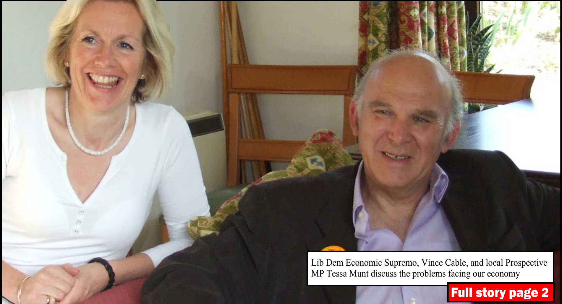
Lib Dem Economic Supremo, Vince Cable, and local Prospective MP Tessa Munt discuss the problems facing our economy